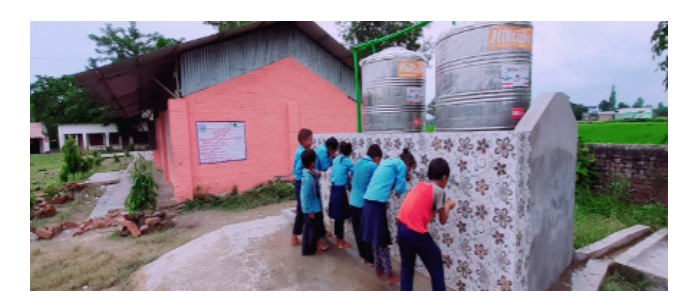
Figure 9: Drinking water facility established in Rastriya Secondary School, Ghodaghodi Kailali

Flooding caused by the Kandra River is a major hazard here. In addition to this, the village also has a problem of contaminated water. Most of the water schemes contain arsenic and the schemes that are deeper have also been found to be contaminated with E. Coli. This includes the drinking water found in the only secondary school in the Ward. Rastriya Secondary School has a total of 269 students (201 boys and