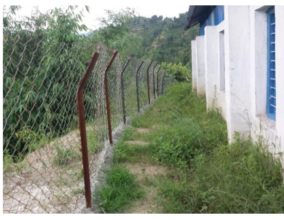
Figure 3: Fencing in the school has been protected children from injuries, Kalika Basic school, Udaypur

The school was established in 1977 and currently there are 81 students, 50 boys and 31 girls. The most surprising fact is that, out of the total students, 50 students are