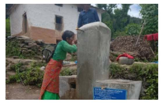
Figure 10: Drinking water facility supported as a small scale mitigation scheme in Purbichauki RM of Doti

Chabalaa community lies in Purbichauki Rural Municipality, Ward No. 3 of Doti district in Sudurpaschim Province. There are 86 households in the community (251 males and 274 females). The livelihood of the people in the community depends on agriculture. The harvest produce only lasts for around three months, making the rest of the year difficult. As a result, most of the males in the community have migrated abroad for work. This has left women with no choice than to carry out all the household chores themselves.