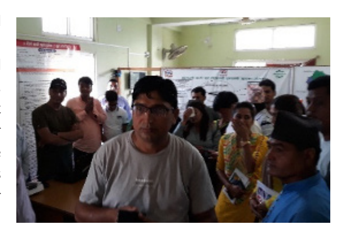
Figure 41: LEOC representatives observing the DEOC Kailali

In 2018, World Vision international Nepal introduced the concept of a Disaster Risk Reduction (DRR) Fund at Rural Municipality level and also supported NRs153,000 ($1,341) as seed money for the fund. Municipalities allocated equal or a little more budget to their fund during that time. The Nepal Disaster Risk Reduction Project continues to follow up on the Palika (Municipalities) as well as Ward level awareness activities and emphasises on preparedness for better response during emergencies.