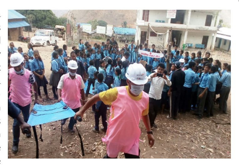
Figure 43: Simulation Exercise in Tapli Rural Municipality, Udayapur

A simulation exercise based on a landslide and earthquake together was demonstrated at Rupatar, Tapli Rural Municipality. The event was organised by the Nepal Disaster Risk Reduction Project (NDRR) which was implemented by Jalpa Integrated Development Society (JIDS) Udayapur in partnership with World Vision International Nepal. The programme was organised on 3rd July 2019 in coordination and in direct involvement with the Local Disaster Management Committee (LDMC) of Tapli Rural Municipality.