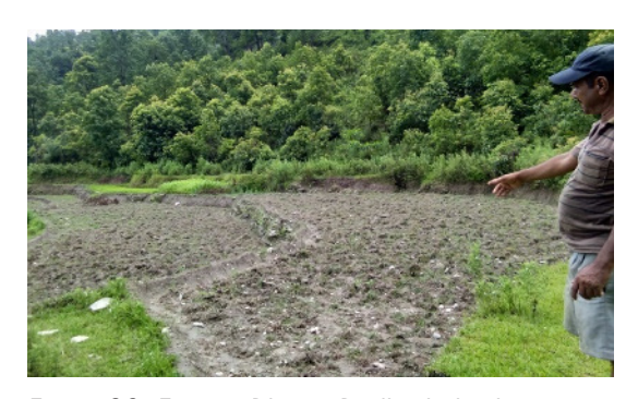
Figure 29- Farmer Bharat Budhathoki showing his farmland with no water supply

The issue of irrigation was identified during the Vulnerability Capacity Assessment (VCA) data collection and prioritized for necessary actions to reduce risks. With WVIN prioritizing on supporting the poor and marginalized to become resilient to disaster and climate change, it was decided to support for 6 inch \times 48 metre and 4 inch \times 80 metre pipes for the immediate