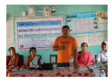
Ward Chairperson of Golanjor 6 during Sajha Sawal