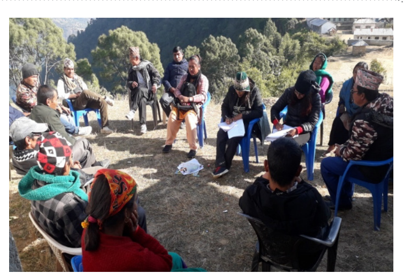
Figure 28: LDMC meeting at Thanagaun, Taapli, Udayapur

Despite the Ward being vulnerable to soil erosion, landslides, fire and storms, there was no disaster risk management earlier. But with the support of World Vision International Nepal and its local partner Jalpa Integrated Development Society (JIDS) in October 2019, a Local Disaster Management Committee was formed through the Nepal Disaster Risk Reduction (NDRR) Project. The project supported the formulation of LDMC along with five different Task Forces that can be mobilised for disaster risk management in the Ward.