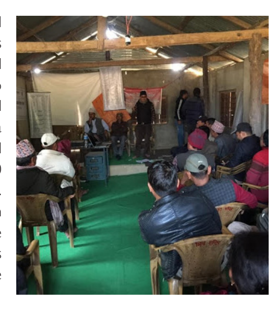
Figure 19: LDMC meeting at Rautamai Rural Municipality, Udayapur

Most importantly, this has been an exemplary local level authority in the district. The local level authorities started to allocate funds towards the Emergency Fund after WVIN supported the seed money equivalent to NRs150,000. They have allocate an Emergency Fund of NRs 1,500,000. Additionally, staff contributed a day's salary equivalent to NRs500,000 and the elected representatives allocated a day allowances of NRs465,500 making a total of NRs2,465,500 as emergency fund. Today the local level has a balance of NRs1,200,000 in the fund while sixty-five hundred thousand rupees have been allocated for COVID-19 response, road networks damaged by floods, and landslides. Repairmen were allocated NRs5,000,000 in 2019.