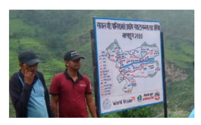
Figure 6: Awareness raising by displaying hazard map in Sayal, Doti

Today the community has become more resilient, but what's more, the Ward level Local Disaster Management Committee is actively working for the mitigation of existing risks in the community. By coordinating with the Rural Municipality level Local Disaster Management Committee, further resources should be available to make the community even more resilient. One of the outcomes is that safe zones are located on the hazard map so that in case of any emergency those locations will be used as safe shelters.