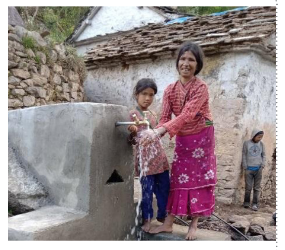
Figure 12: Drinking water reaches the village after the maintenance of water scheme in Purbichauki RM Doti

For the past six months, World Vision International Nepal (WVIN) along with its local partner Community Development Centre (CDC) Doti has been implementing the Nepal Disaster Risk Reduction (NDRR) Project in this community. The most pressing vulnerabilities of the communities have been identified and a Local Disaster and Climate Resilience Committee (LDCRC) and various sub-committees supported to be re-energized. Although the committee had been organising cleanliness campaigns, water source cleaning drives, and had requested the local government and various organisations for support to construct/repair the drinking water supply schemes, no support had been forth-coming. Ever since WVIN and CDC's project entered the community, the locals shared the drinking water problem as their main issue and that in