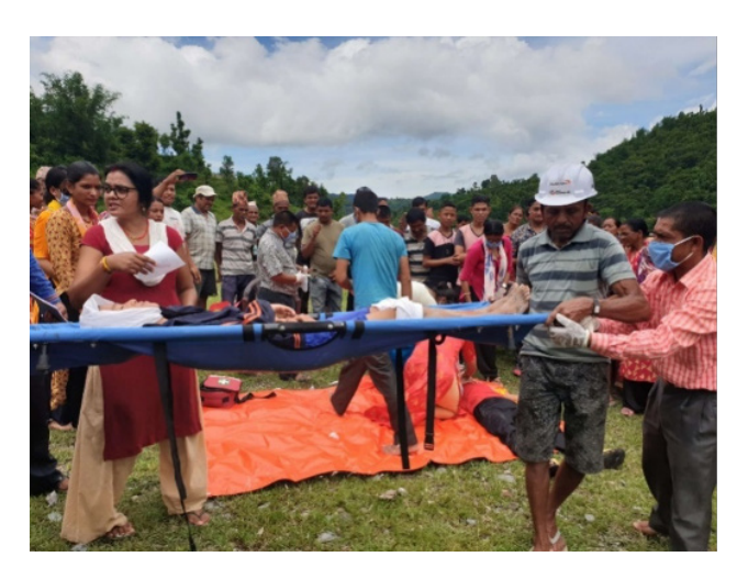
Participants in the simulation