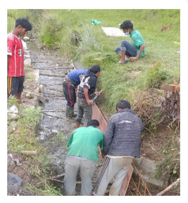
Figure 34: People maintaining the water and electricity cannel in Tatopani RM of Jumla

The project supported the maintenance of the canal to benefit both irrigation and local electricity production. Thirty metres of canal maintenance was done through the support of project. Earlier the canal was in very poor condition but now proper irrigation has supported its fertility and many vegetables have been produced. With regards to electricity, with the canal now operating properly there is continuous electricity in the community. In addition, leakage problems have also been solved. The Chairperson of Canal Maintenance Committee expressed his hope of providing regular electricity to 163 families and irrigation to 93 Acre of land.