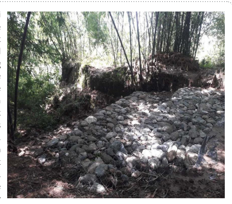
Figure 15: The embanlment of the rivulet using gabon wire and stone in Simariya Tole.

In the meantime, WVIN and Nari Bikash Sangh were implementing the Nepal Disaster Risk Reduction Project in Ward No. 5 of Gramthan Rural Municipality and were supporting the Ward Local Disaster and Climate Resilience Plan (LDCRP). This issue was raised and discussed resulting in the construction of an embankment with gabion boxes filled with stones on both sides of the embankment. This minimized the risk of bank erosion and cutting which would have impact nearby 300 houses. Agat Lal Majhi, a resident of Simariya Tole states, "We were very afraid as the river had already eroded away 90% of the sides of the rivulet and we felt this monsoon the