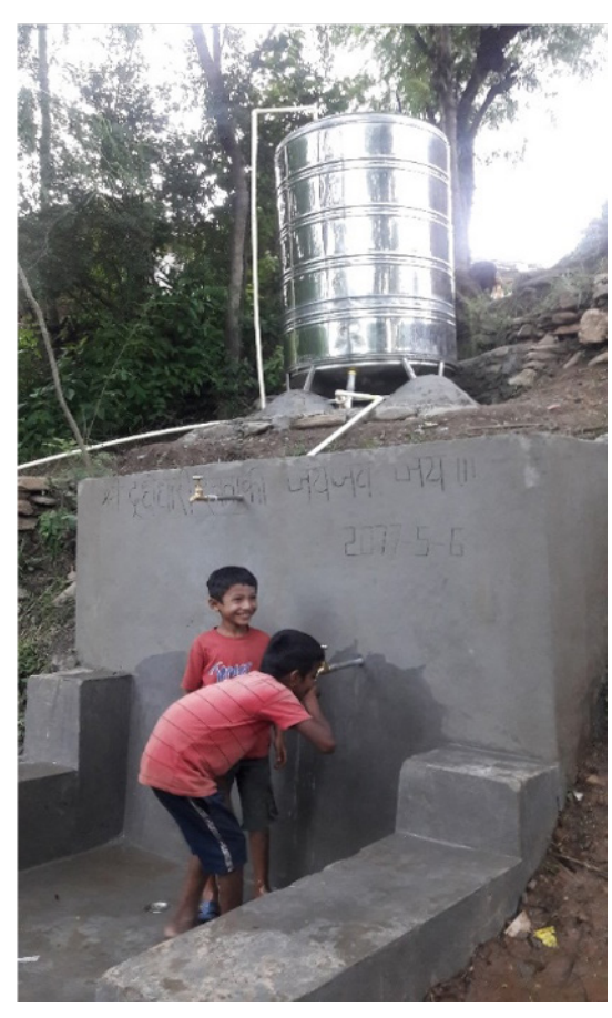
Figure 1: People benefitted by the newly constructed drinking water scheme of Saltada, Doti.

"We were worried about the condition of the old water reservoir, it used to leak and wasn't able to hold water as per its capacity. Although this problem was identified in our plan we were unable to repair it due to various reasons. Thanks must be given to CDC Doti and World Vision International Nepal for providing