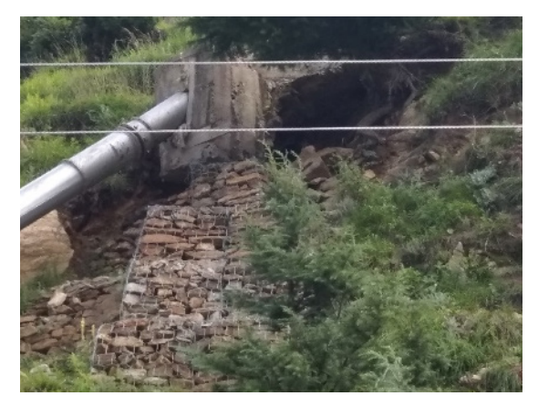
Figure 11: Gabion wall for the maintenance of local electricity powerhouse in Jumla

The Nepal Disaster Risk Reduction Project (NDRRP) was implemented with financial support from World Vision International Nepal in partnership with KIRDARC Nepal. The NDRR Project supported to develop the Local Disaster and Climate Resilience Plan in the same Ward. Based on this plan, initiatives to repair the hydroelectricity project were taken and gabion walls were set up and trees planted in areas affected by monsoon landslides. All the villagers participated in this work.