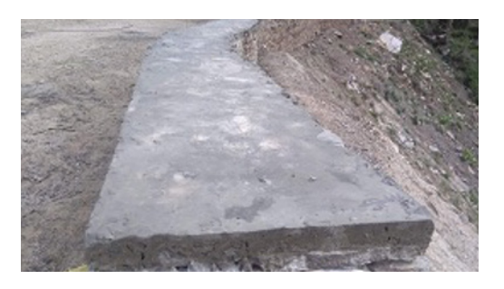
Figure 32: Mititgation scheme to support the school for the construction of a compound wall before and after photo of Ghattedanda Basic School, Mellekh Achham