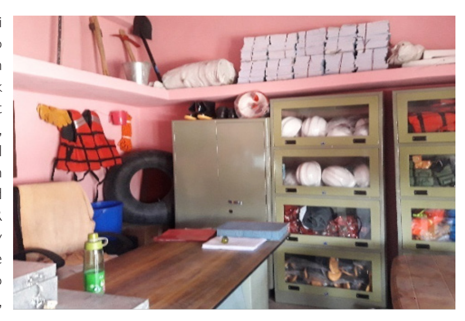
Emergency Operation Centre and DRR & CCA Learning Centre together in Gramthan Rural Municipality

However, in 2018, Naari Bikas Sangh in partnership with WVIN came up with the Nepal Disaster Risk Reduction Project. As part of this project intervention, Gramthan Rural Municipality's capacity on DRM has been strengthened through the several DRR orientations and capacity building trainings. training were provided to local community individuals, Task Force members, local elected representatives and even to the DRR focal