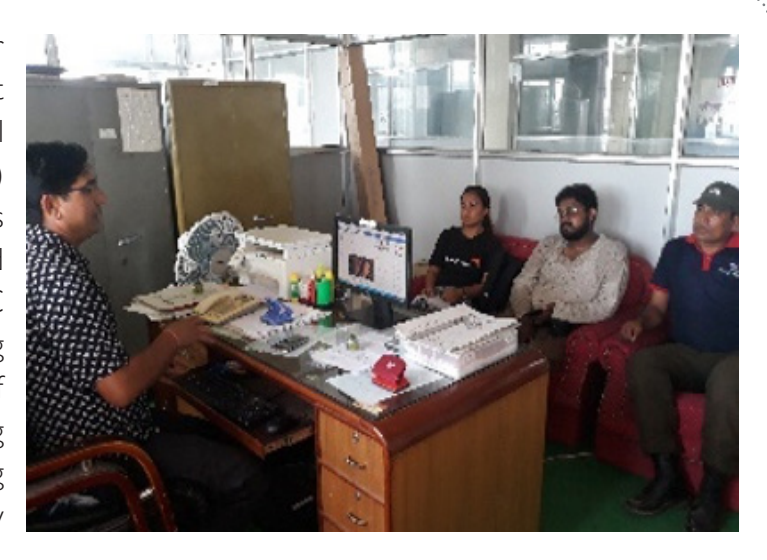
Figure 39: Discussion for the smooth operation of LEOC at Tikapur Municipality, Kailali

existing Local Earlier, the Disaster Management Committee functional. However, once the Local Emergency Operation Centre (LEOC) was reactivated, the LDMC meetings became regular. The meetings are held on a needs-basis. This year, the LEOC called a monsoon preparedness meeting for the first time before the arrival of the monsoon. Stakeholders, including the media, were invited to the meeting where they discussed and decided how to function during any emergency. The meeting concluded that the FM stations would broadcast the Early Warning