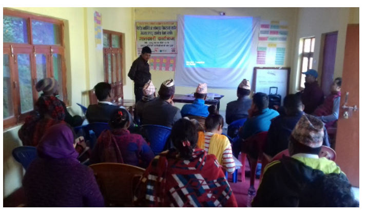
Figure 37: LDMC meeting at Purbichauki Rural Municipality of Doti

Nepal is a mountainous country that straddles the boundary between the Indian and Himalayan Tectonic plates. Many hills in Nepal are situated in or near landslide areas. Approximately 260 people lose their lives annually due to landslides in Nepal, with around 3,000 families being affected. Similar types of problems were identified in Purbichauki Rural Municipality of Doti district. All the stakeholder of the Rural Municipality and Community Development Centre Doti, in Partnership with World