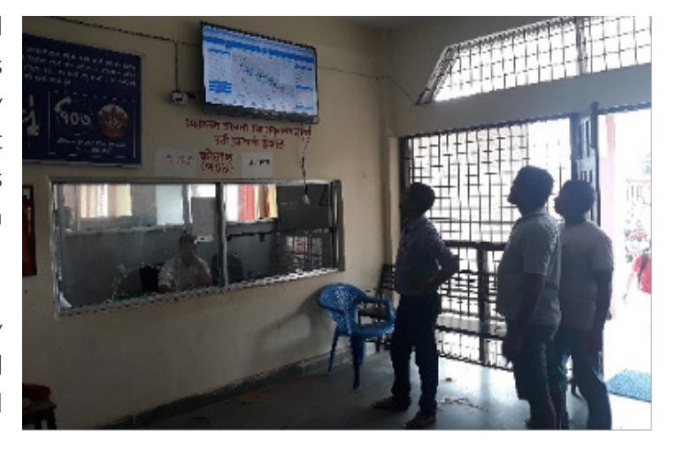
Figure 40: People geting information from a display managed by Tlkapur ELOC, Kailali

"An early warning system had already been installed in the Karnali, Kandra and Mohana rivers, but we needed to depend on the District Emergency Operation Centre for any information or updates on floods or disasters. We did not have any