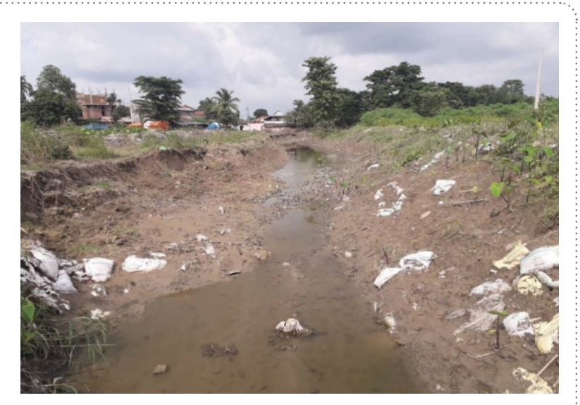
The canal after maintenance

When Nari Bikash Sangh, with support from WVIN, stepped in it implemented the Nepal Disaster Risk Reduction Project. The Ward level Local Disaster Management Committee was formed and carried out Vulnerable Capacity Assessment training in order to form the LDCRP. As per the plan, the immediate issue was to clean-up the river so it would flow as it did before. In this way the local community did not have to face being inundated with water on an annual basis.