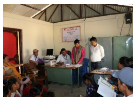
Ward Chairperson of Tinpatan 4 during Sajha Sawal