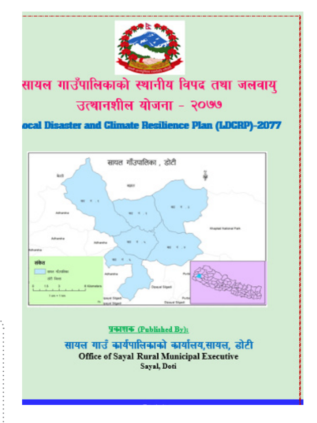
Figure 5: Local disaster and climate resilience plan of Sayal RM, Doti

After the completion of the LDCRP plan, the local community coordinated and consulted with the Rural Municipality Office and submitted a proposal for support to make the community resilient. The plan had been reflected in the LDCRP of Sayar Rural Municipality and thus the Municipality allocated NRs568,987.00. With this money the Ward procured and managed 40 gabion nets and constructed a wall to protect the land and community from possible landslides.