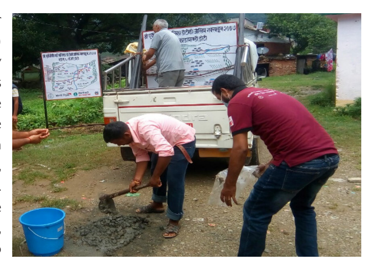
Figure 38: Installation of hazard board in the community of

As a process of the Local Disaster and Climate Resilience Plan (LDCRP) formulation, a Vulnerability and Capacity Assessment was carried out. Landslides were identified as major hazards in the whole Purbichauki area. Similarly, the Local Disaster and Climate Resilience Plan identified many other risks in the education, child, and drinking water sectors as well. After the VCA was conducted by the Nepal Disaster Risk Reduction Project, the project started its activities, taking into account the hazards and their locations. And formulated policies accordingly. There was enthusiastic participation by