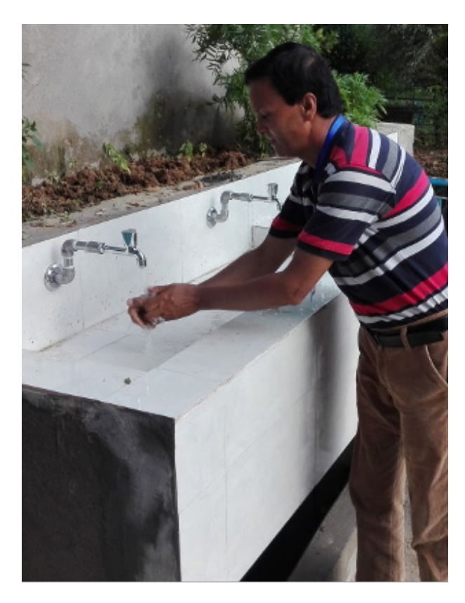
Figure 23: Handwashing station supported by the project in Kankali Secondary School, Kathmandu

Learning about this problem, CDS and WVI Nepal then constructed a child friendly drinking water tap under the Nepal Disaster Risk Reduction (NDRR) Project in the school. About 200 students now have access to drinking water. The tap has been constructed in such a way that students of both primary and secondary levels have easy access to drinking water. Bisnu shares, "The whole school is very happy that we have a good child friendly drinking water tap now. We