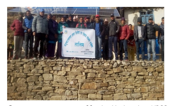
Government representatives of four local bodies where NDRR is implemented during a Vulnerability and Capacity Assessment (VCA) Training, Jumla

World Vision International Nepal and KIRDARC Nepal have been implementing the Nepal Disaster Risk Reduction Project (NDRR) in these four areas since 2018, through which the newly elected local