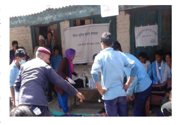
Figure 13: Local people along with Nepal police and other technical staff practicing simulation practice in Tila RM, Jumla

When KIRDARC, in partnership of World Vision International Nepal, started the Nepal Disaster Risk Reduction Project in Tila Rural Municipality of Jumla, the elected representatives oriented locals on the basic concepts of disaster risk management and national and international policies relating to it. Following the orientation, discussions and training at Ward level and Municipal level, the Rural Municipality realised the importance of disaster risk reduction and committed to work for it themselves. They then prepared their own act on disaster risk reduction.