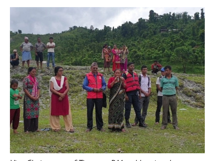
Vice Chairperson of Tinpatan RM addressing the simulation participants