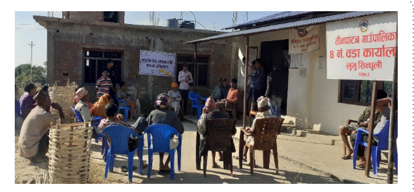
Figure 25: CDMC meeting TInpatan, Sindhuli

After the orientation on the project interventions, the Community Disaster Risk Management Committee (CDMC) and Task Force in the community were formed. The committee and Task Force were also oriented about the emergency fund and its implications. When the community learned about the importance of an emergency fund they were ready to establish it