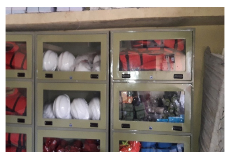
Search and Rescue materials stockpile in Gramthan Rural Municipality

Khadra river. A large number of lives and money has been lost through these disastrous events in the past, among which the unforgettable flood of 2017.