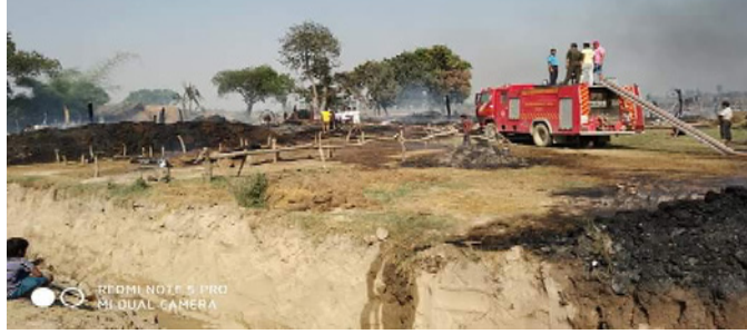
Figure 35: Small houses destroyed in Bhajani-7 and fire bridgade